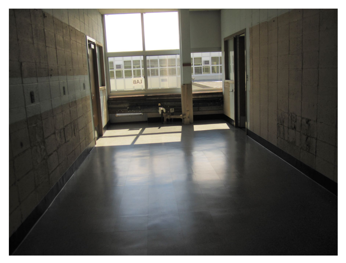
zSpace classroom moved to a new space in the Library