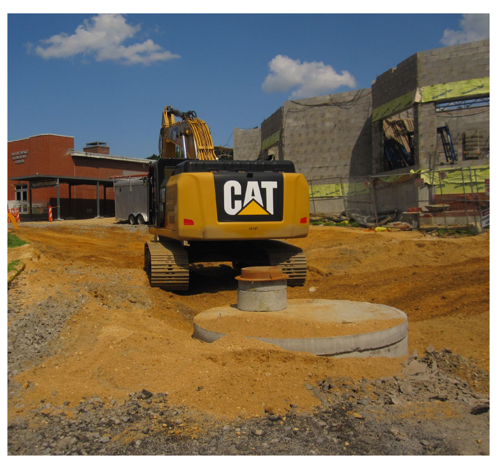
New driveway and side of addition