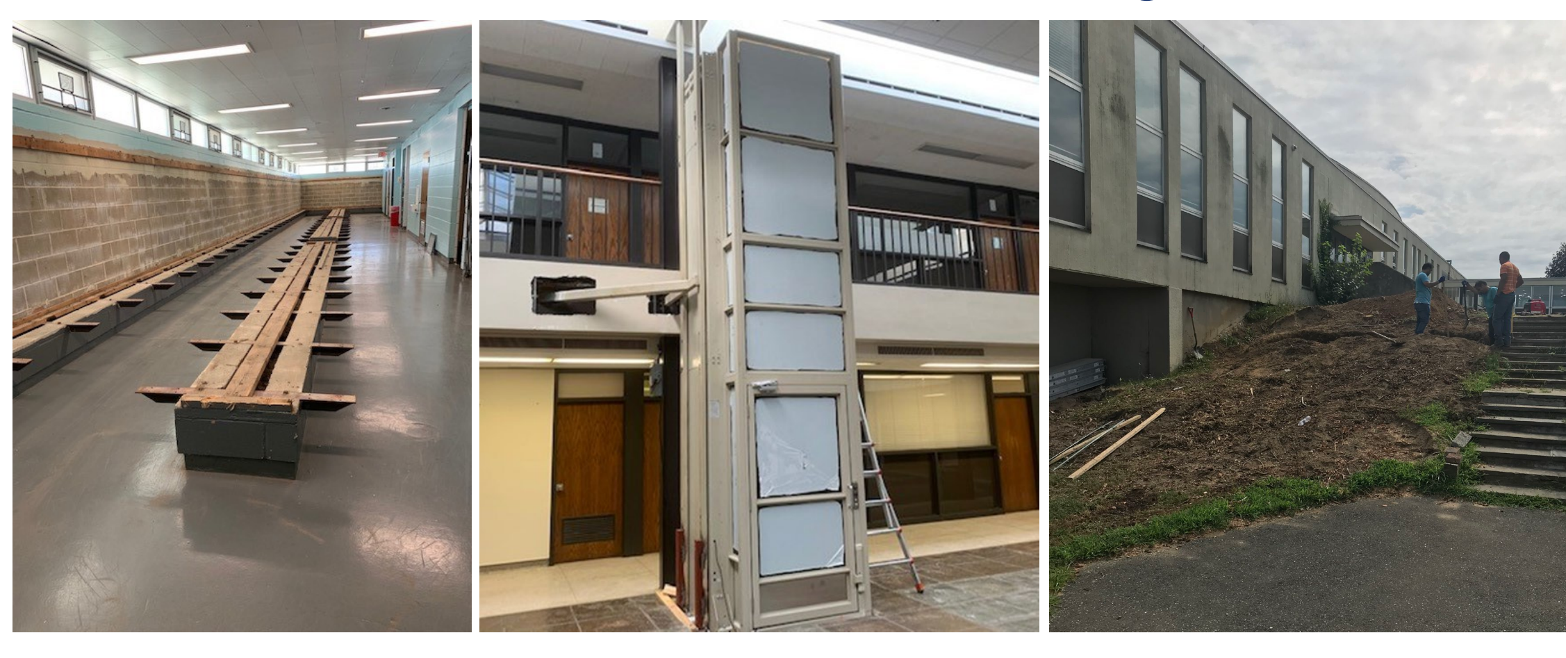
Locker Room renovation