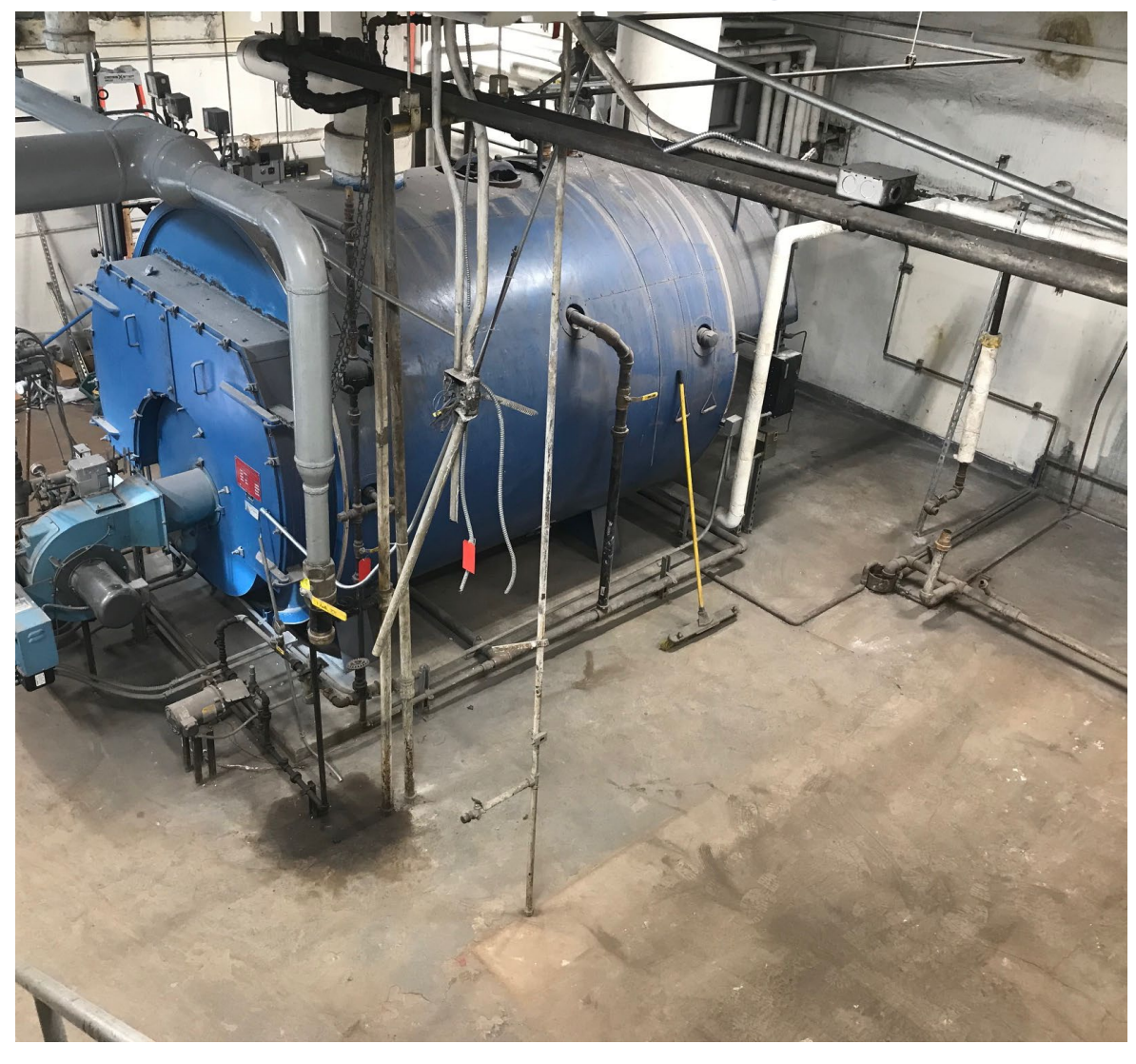
Getting boiler room ready for new boiler