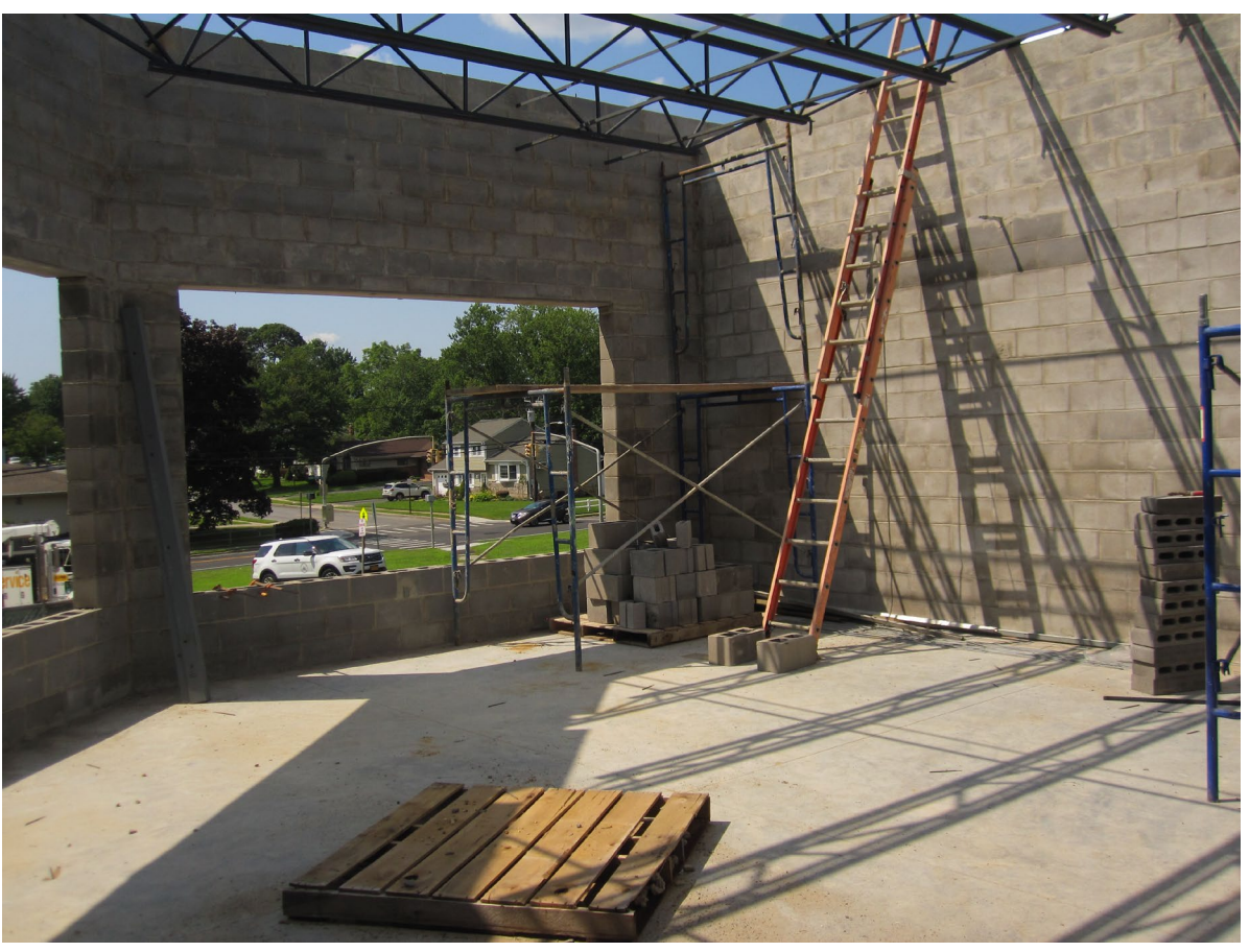
Exterior wall of classroom addition with exterior brick being installed.