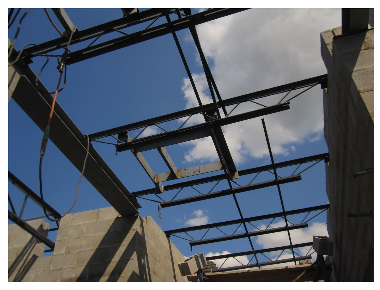
Roof of addition during construction